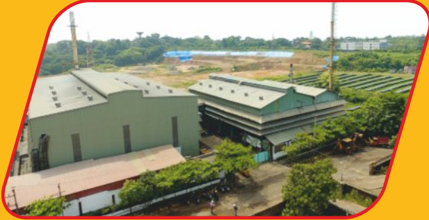
Eswari Global Metal Industries - Unit 1 Industrial Area, Baikampady, Mangalore, India