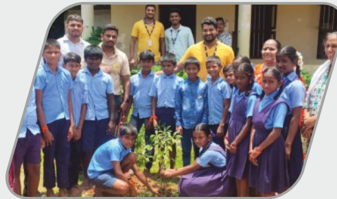
Tree Plantation at Govt. Primary School