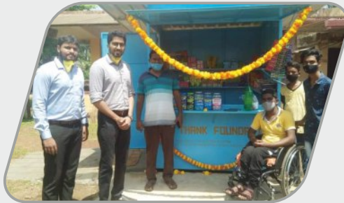
Donating Petty Shop