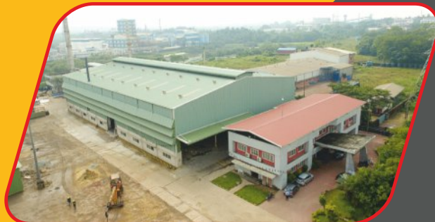
Eswari Global Metal Industries - Unit 3 Industrial Area, Baikampady, Mangalore, India