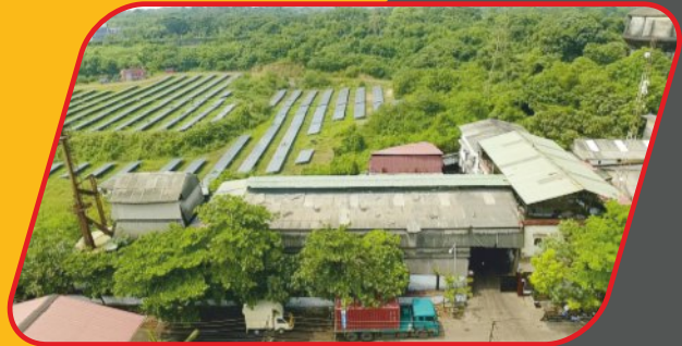
Eswari Global Metal Industries - Unit 2 Industrial Area, Baikampady, Mangalore, India