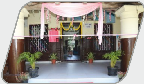
Primary School Renovation