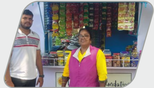
Donating Petty Shop